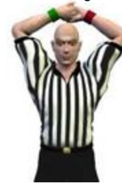
16. Interlocking Hands or Grasping Clothing