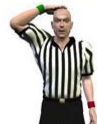
23. Flagrant Misconduct Left/Right Hand