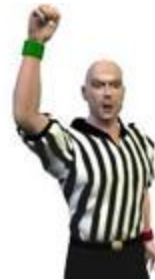
15. Stalling Left/Right Hand