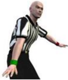
8. Indicates No Control