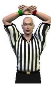
3. Time Out