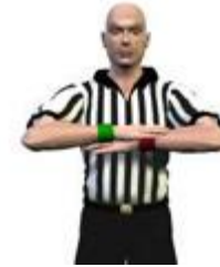
11. Defer Choice