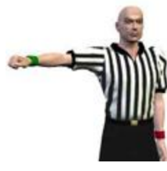
24. Coach Misconduct Left/Right Hand