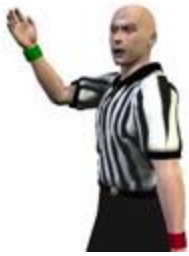
1. Starting the Match