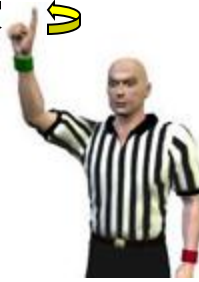
4. Start Injury Clock