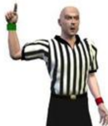
21. Awarding Points Left/Right Hand