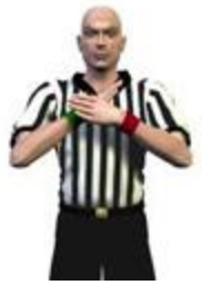
6. Stop Injury/Blood/Recovery Clock