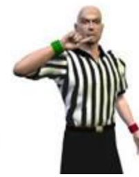
5. Start Blood Clock