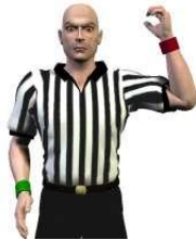
14. Caution-False Start or Incorrect Starting Procedure