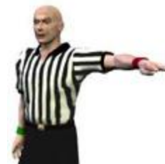
22. Unsportsmanlike Conduct Left/Right Hand