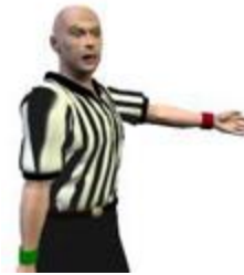
10. Indicates Wrestler in Control Left/Right Hand