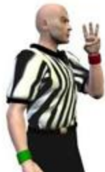
20. Near-Fall: 2, 3 or 4 Points