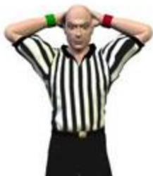
19. Illegal Hold or Unnecessary Roughness