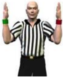
7. Neutral Position