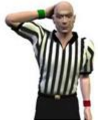
12. Potentially Dangerous Left/Right Hand