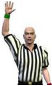
2. Stopping the Match