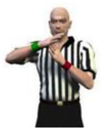
18 Technical Violation